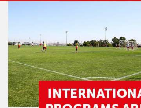
INTERNATIONAL PROGRAMS AREA