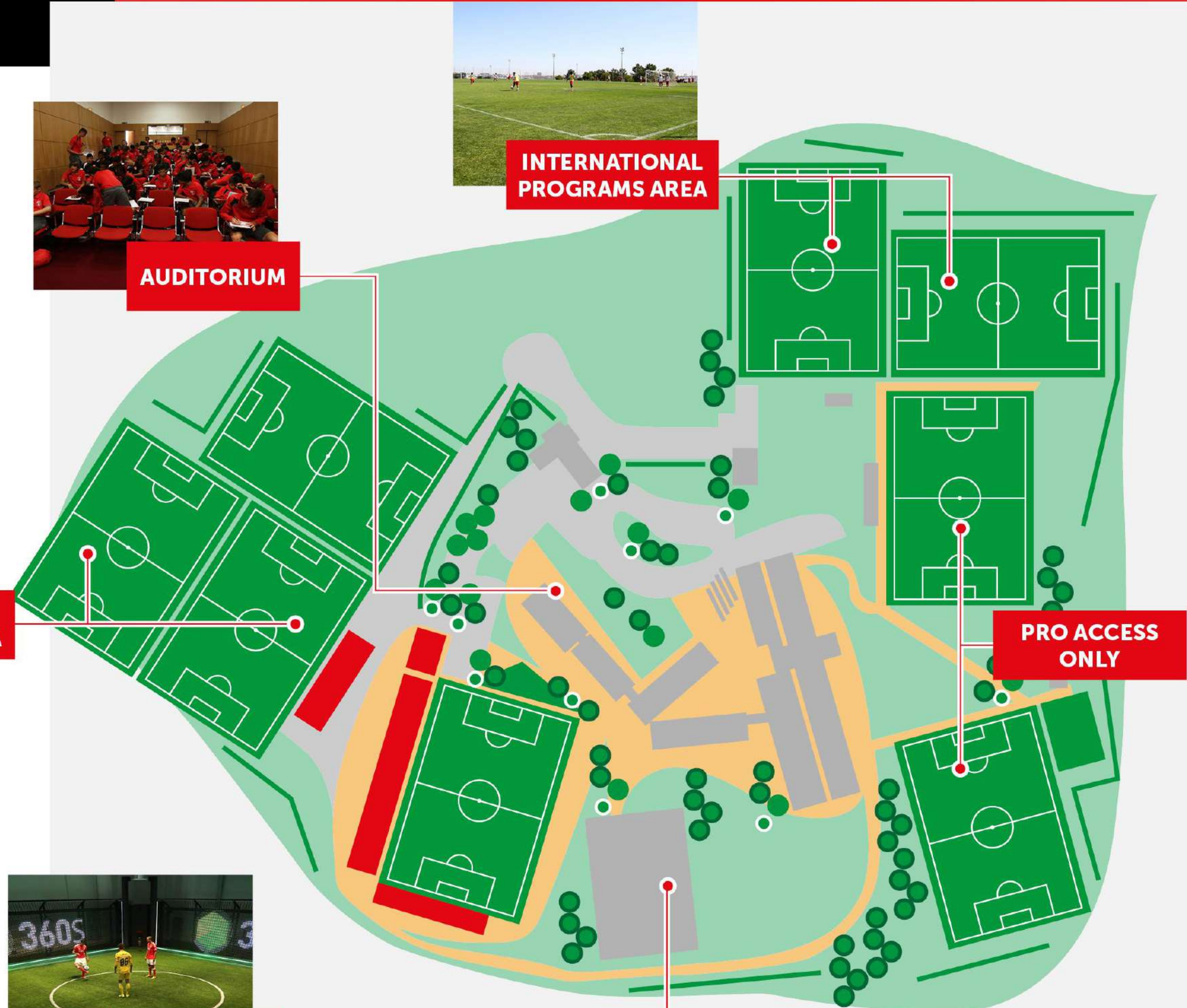
PRO ACCESS ONLY